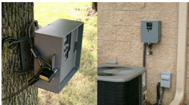
Heavy Duty Bear Box