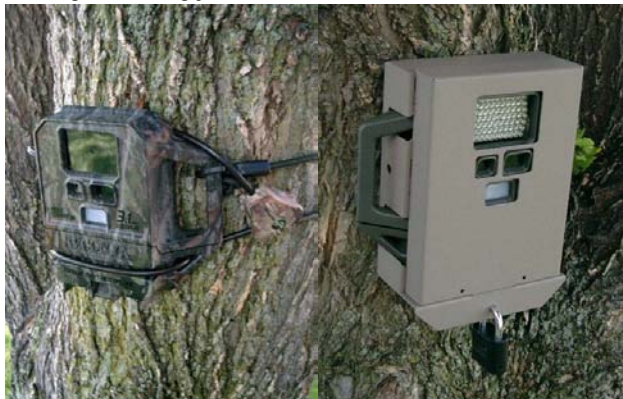
Python™ style lock